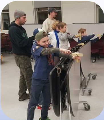
Turkey Shooters: November Pack Meeting

Any advancements earned will be presented at 7:45PM. Come celebrate with your scout!